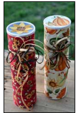
Pringles cans! Great for cookies!