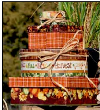
The paper mache boxes above make a great statement, and are all made using just fabric and Mod Podge®.