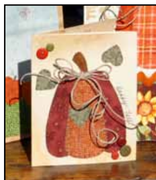
Making a greeting card that coordinates with your quilted project is a great way to complete a gift. These tri-fold cards by Hillcreek Designs allow you to conceal stitching or brads that may have been used on the front of the card so they do not show when the card is opened! Check out our website to purchase these cards!

The Wooden Bear www.thewoodenbear.com service@thewoodenbear.com www.woodenbear.typepad.com 1-866-927-8458