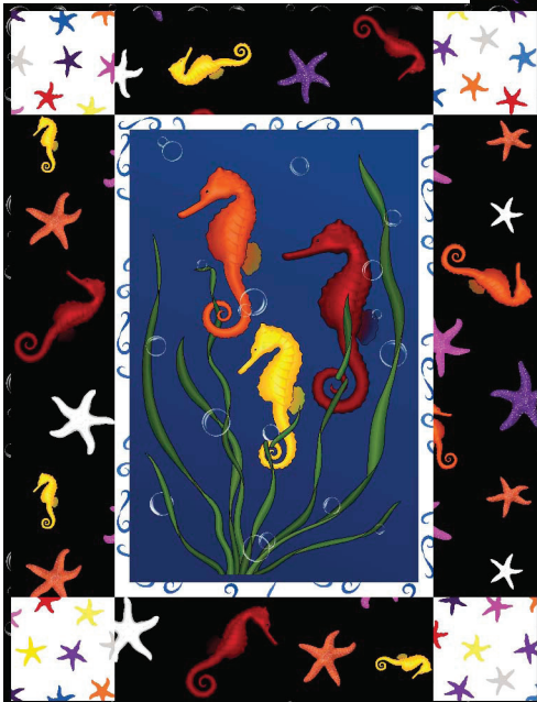
Seahorses: 18 3 / 4 " x 24 1 / 4 "