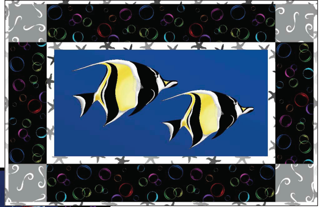
Moorish Idols: 20" x 13"