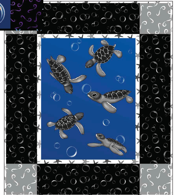
Baby Turtles: 20" x 23 1 / 4 "