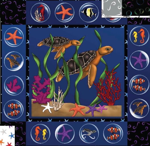
Turtles: 24 3 / 4 " x 24"