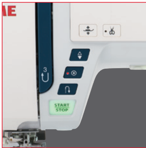
Easy Convenience Buttons