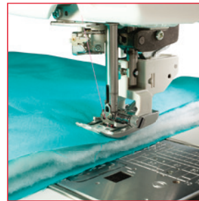
AcuFeed Flex Layered Fabric Feeding System