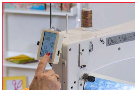
Digital LCD Touchscreen Displays