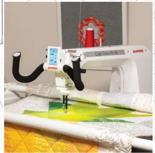
Adjustable Front and Rear Handlebars