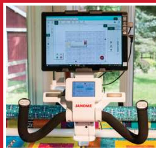
Pro-Stitcher pictured on QMP18