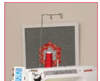
Built-in Thread Stand

*Rear handlebars are an optional accessory