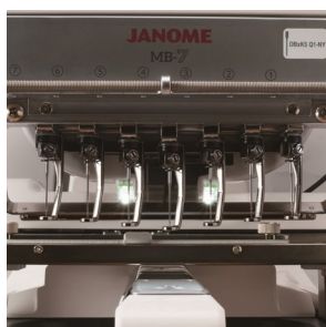
Includes 7 Needle Heads