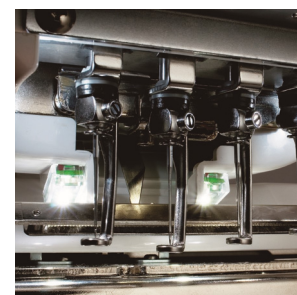
6 White LED Lights