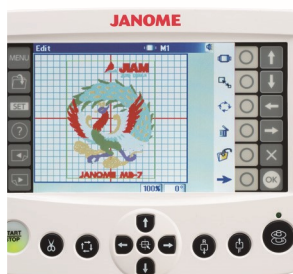
RCS (Remote Computer Screen)