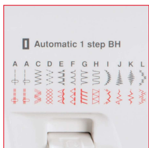
22 Built-In Stitches & 1 One-Step Buttonhole