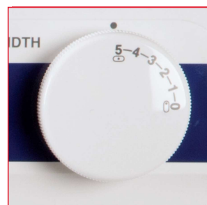
Stitch Width Adjustment