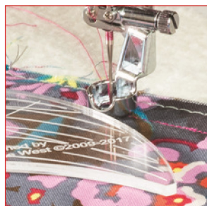
Ruler Quilting Function