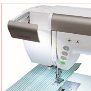
Full Intensity Lighting System