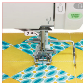
Detachable AcuFeed™ Flex Layered Fabric Feeding System