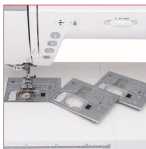
3 One-Step Quick Change Needle Plates