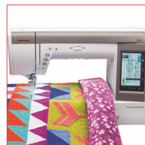
11" Bed Space