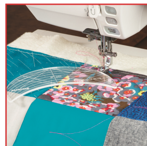
Ruler Work Feature and foot included