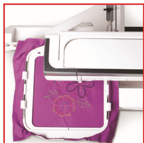
Maximum Embroidery Area: 9.1" x 11.8"