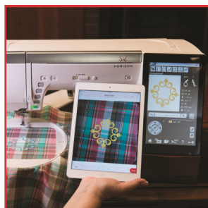
Innovative Wi-Fi Technology