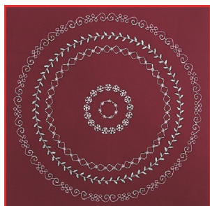
AcuStitchTool - Advanced Stitch Programming