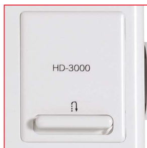
Reverse Stitch Lever