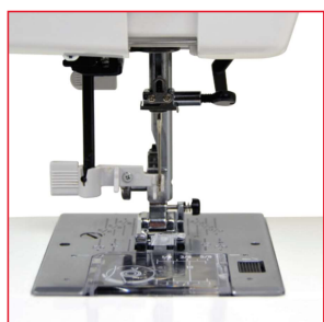
Built-In Needle Threader