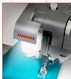
Built-in, Retractable LED Light