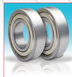
Ball Bearing Main Shaft