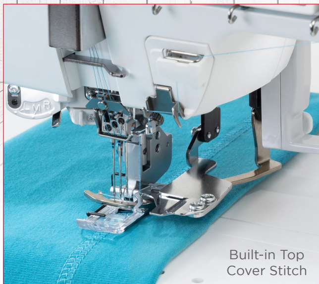
Built-in Top Cover Stitch