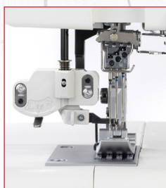
Built-in Needle Threader