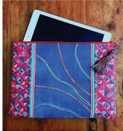
Serge It! Tablet Zipper Case

Here's a sleek, beautiful case to carry and protect your iPad or tablet loaded with Serger techniques and tips.