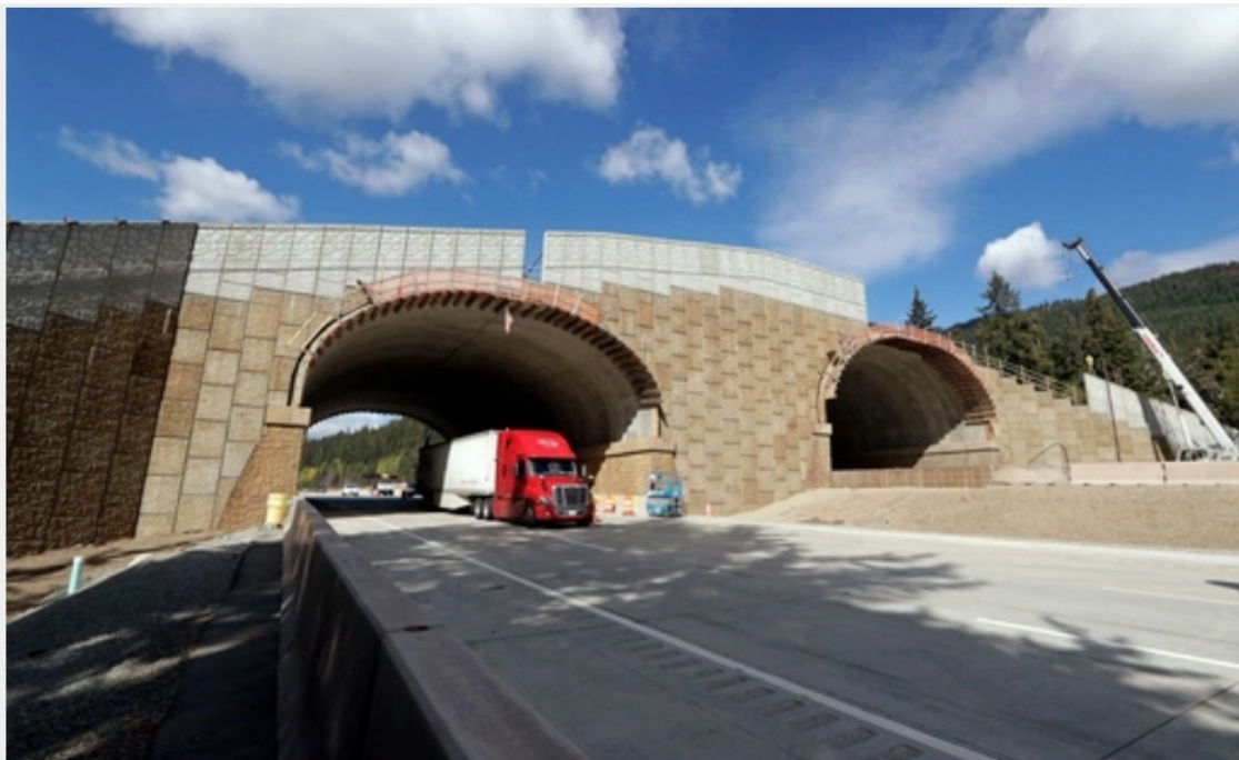
FILE - Eastbound Interstate 90 traffic passes beneath a wildlife bridge under construction on Snoqualmie Pass, Wash., on Oct. 4, 2018. New Mexico will build its first wildlife highway overpasses for free-roaming cougars, black bears, bighorn sheep and other creatures large and small and will also set aside $100 million for conservation projects, under two bills signed Thursday, March 23, 2023, by Gov. Michelle Lujan Grisham.

SANTA FE, N.M. (AP) — "New Mexico will build its first wildlife highway overpasses for free-roaming cougars, black bears, bighorn sheep and other creatures large and small and will also set aside $100 million for conservation projects, under two bills signed Thursday by Gov. Michelle Lujan Grisham.