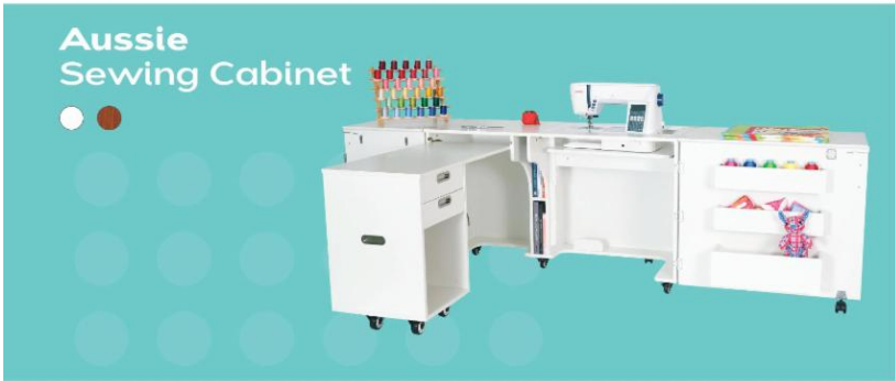
Aussie Sewing Cabinet