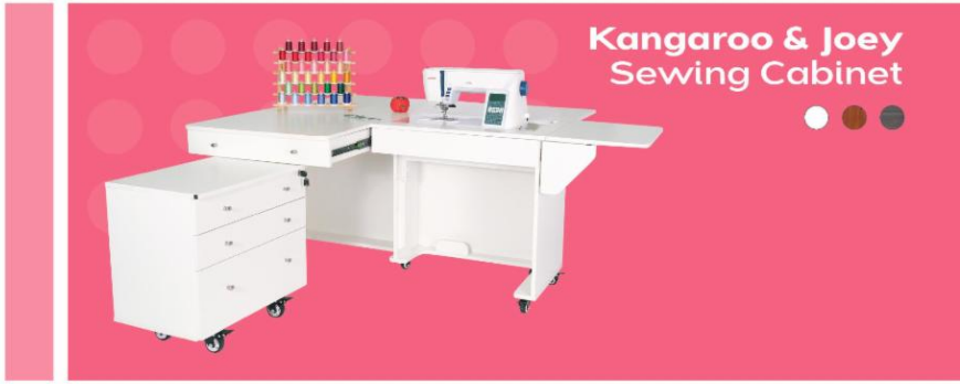
Kangaroo & Joey Sewing Cabinet