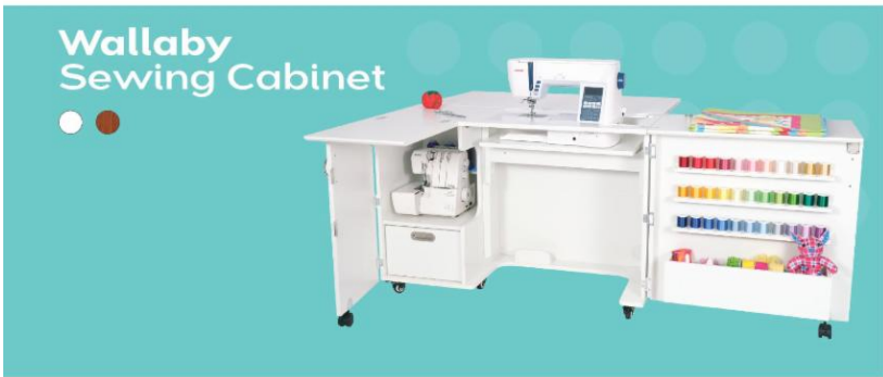
Wallaby Sewing Cabinet