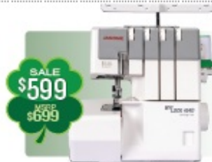
My Lock 454D