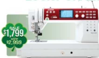
Memory Craft 6650