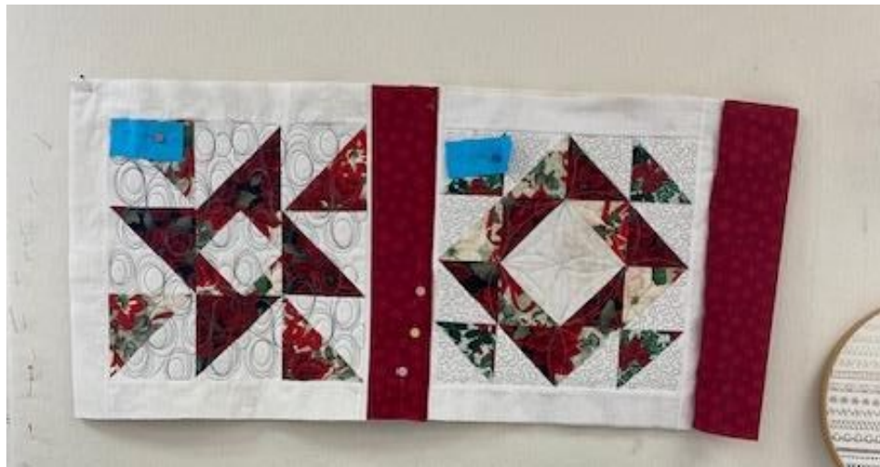
Barbara S.'s Block of the Month Layout