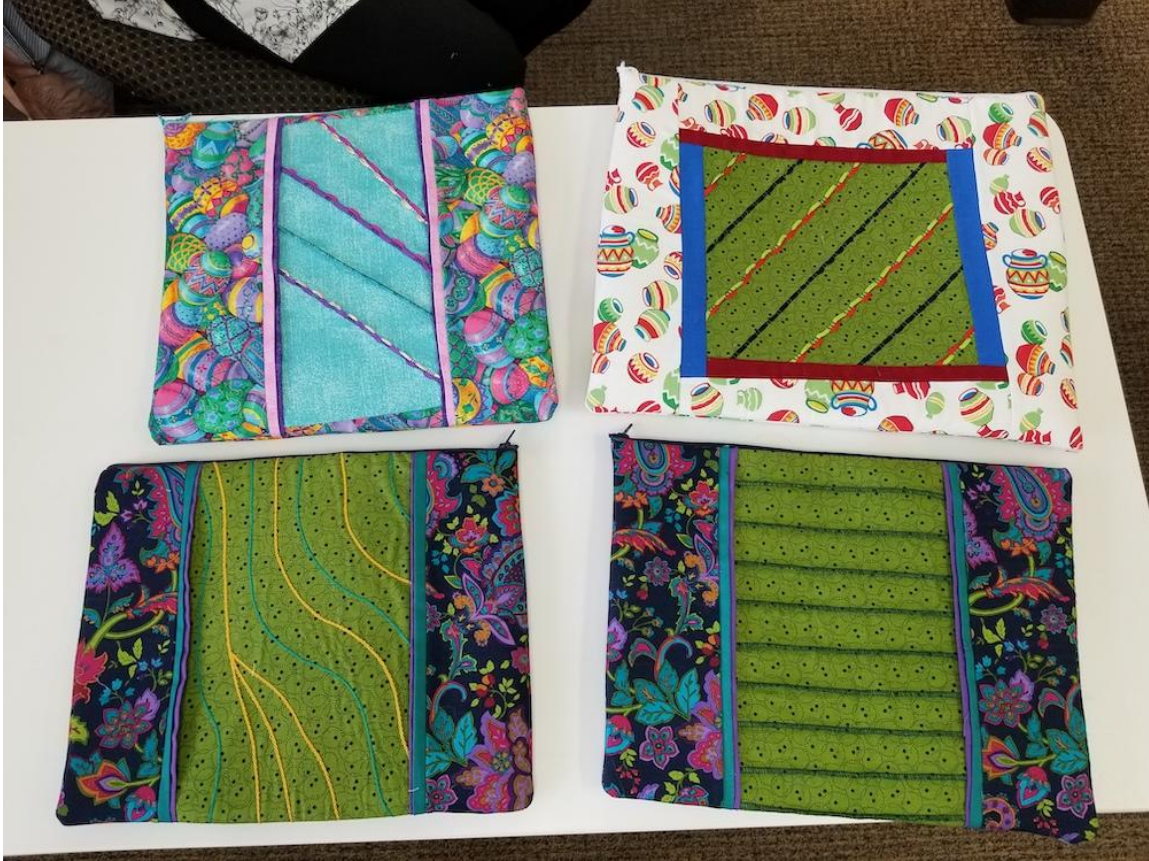
Margret T. First two BOM blocks put together QAYG style.