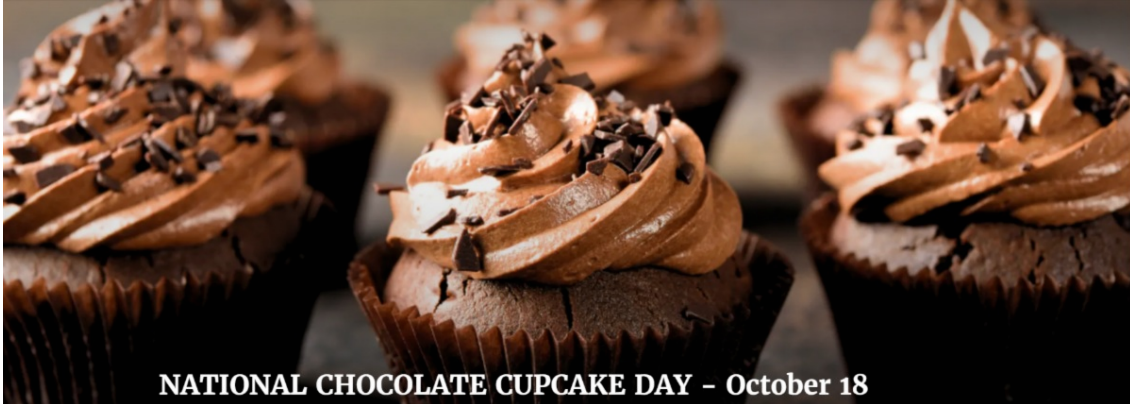
NATIONAL CHOCOLATE CUPCAKE DAY - October 18