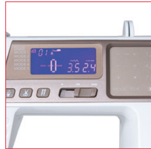
Easy Navigation and LCD Screen