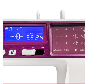
Easy Navigation and LCD Screen