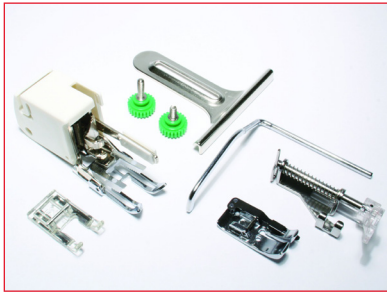
Quilting Set Included