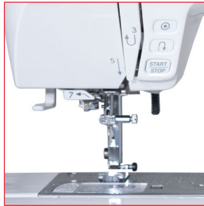
Superior Needle Threader with Thread Guide 7