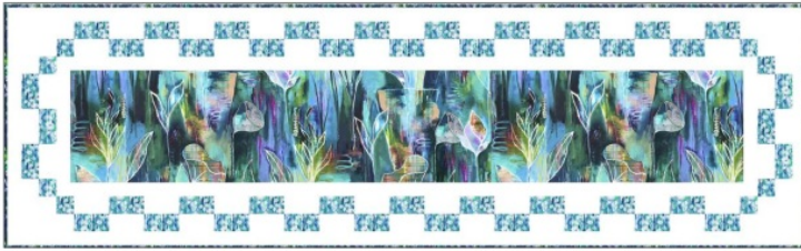
Table Runner size: approximately 17" x 57"