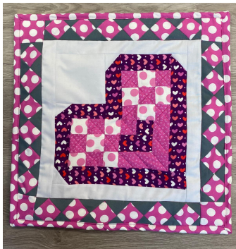
Have a Heart