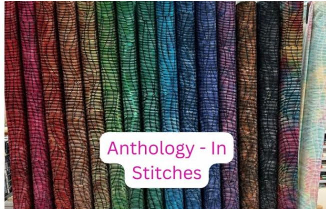
Anthology - In Stitches