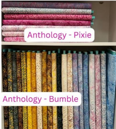
Anthology - Pixie