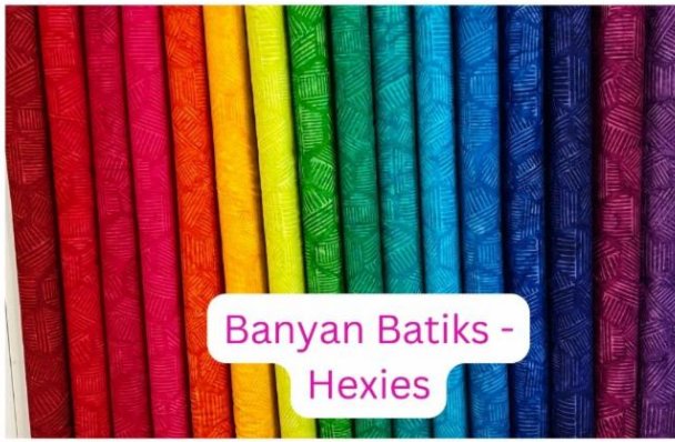
Banyan Batiks - Hexies