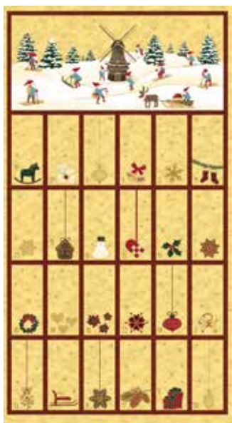
A: 4595-286 1 Panel