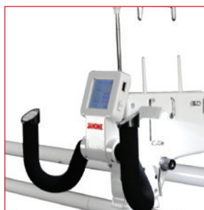
Adjustable Front and Rear Handlebars