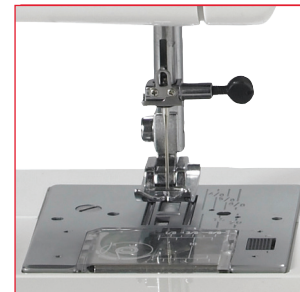
Snap-On Presser Feet