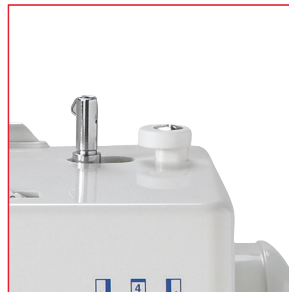
Push/Pull Bobbin Winder