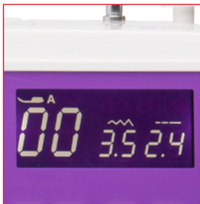
Backlit LCD Screen with 200 Built-in Stitch Options