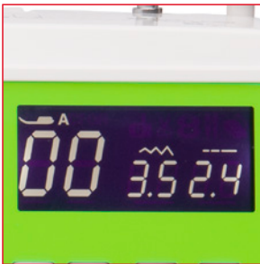
Backlit LCD Screen with 50 Built-in Stitch Options