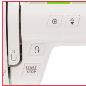
Easy Convenience Features