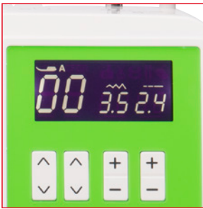
Backlit LCD Screen with 50 Built-in Stitch Options