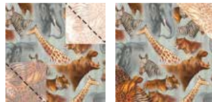
A Unit - Make 6