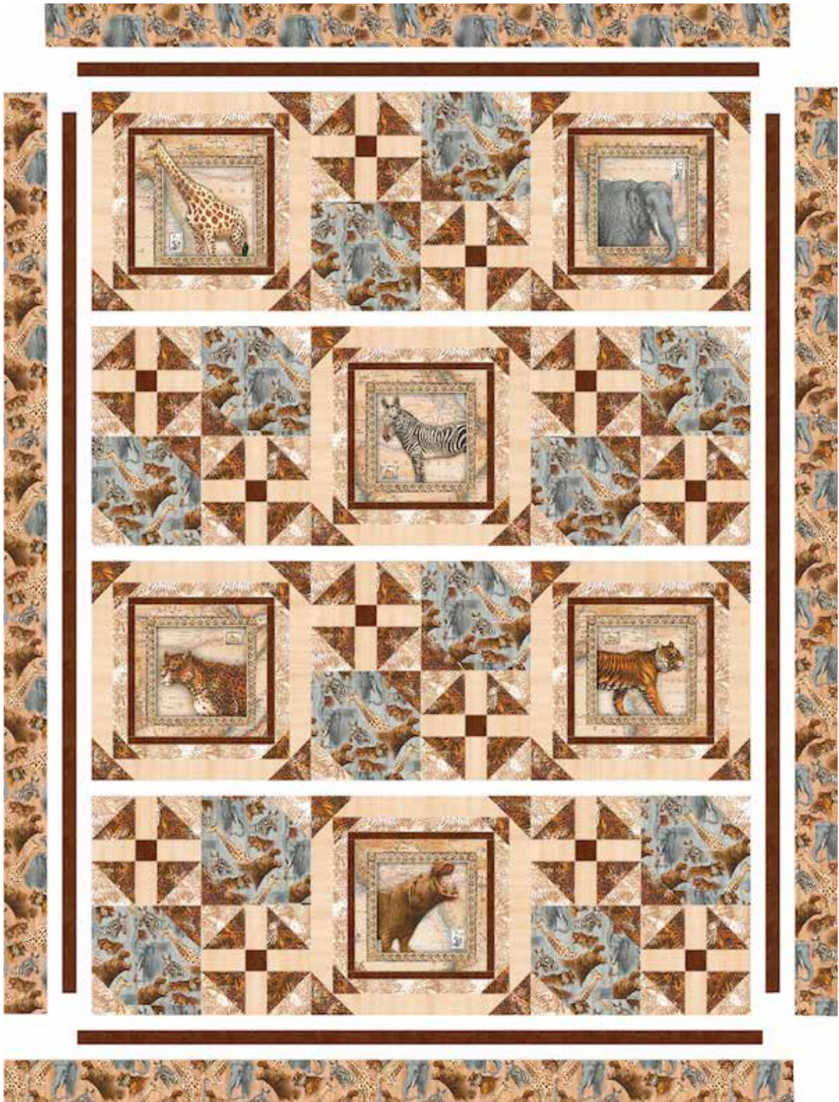
Exploded Quilt Diagram