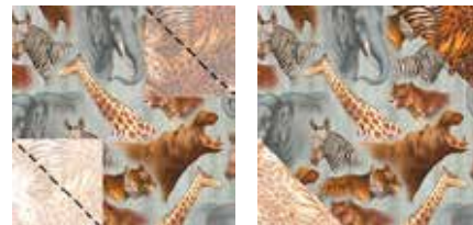
B Unit - Make 6