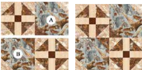
Crossing Africa Block - Make 6