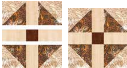
Corner Unit - Make 12