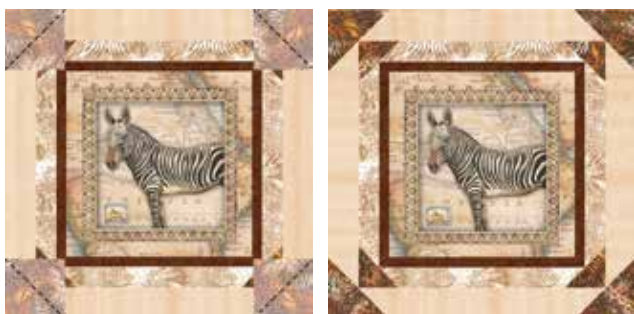
Framed Animal Block - Make 6