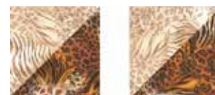
Triangle Units - Make 48