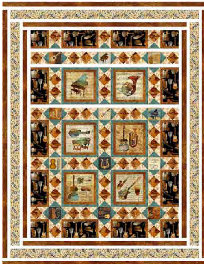
Exploded Quilt Diagram