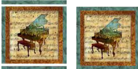
Framed Music Block - Make 6