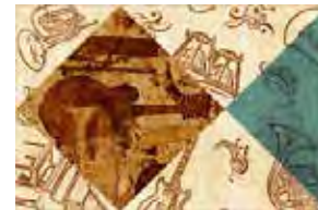
Edge Sashing Unit Make 14