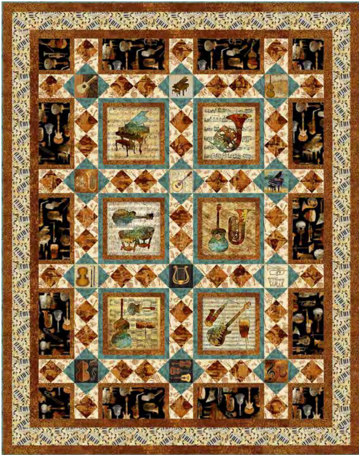
Designed By: Sue Harvey and Sandy Boobar of Pine Tree Country Quilts Finished Quilt Size: 60" x76" Finished Block Size: 12" x 12", 6" x 12" and 6" x 6" Number of Blocks: 6, 10 and 4

Designed by: Sue Harvey and Sandy Boobar