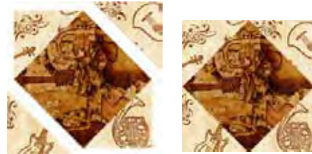
Diagonal Square Unit Make 48