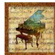
Trim to 11" x 11"