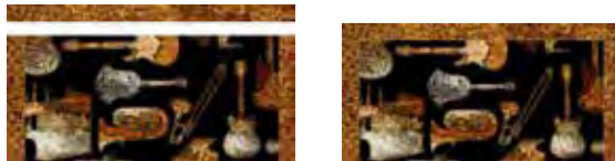
Edge Block - Make 10