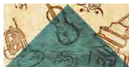
Triangle Unit Make 48