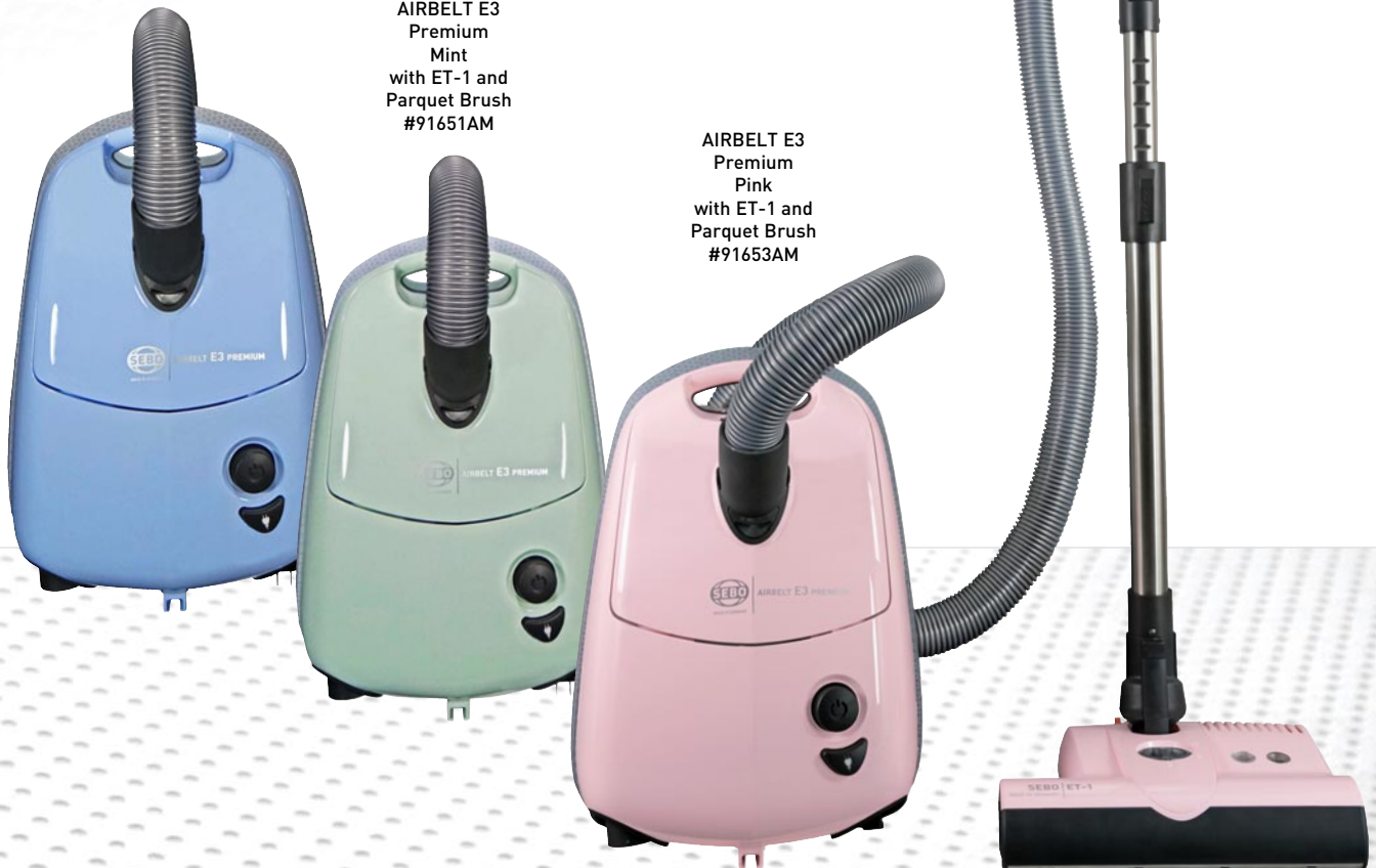
AIRBELT E3 Premium Pink with ET-1 and Parquet Brush #91653AM