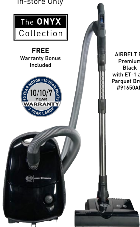
AIRBELT E3 Premium Black with ET-1 and Parquet Brush #91650AM

Three On-board Tools are Included with All AIRBELT E models.