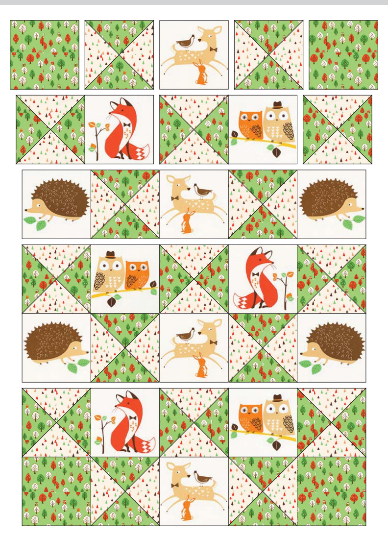
Step 4: Arrange the hourglass blocks, Fabric A blocks and Fabric B squares into seven rows of five blocks. Note the fabric placement and block orientation in the Quilt Assembly Diagram.

Step 5: Sew the blocks together to form rows. Press the seams away from the hourglass blocks.