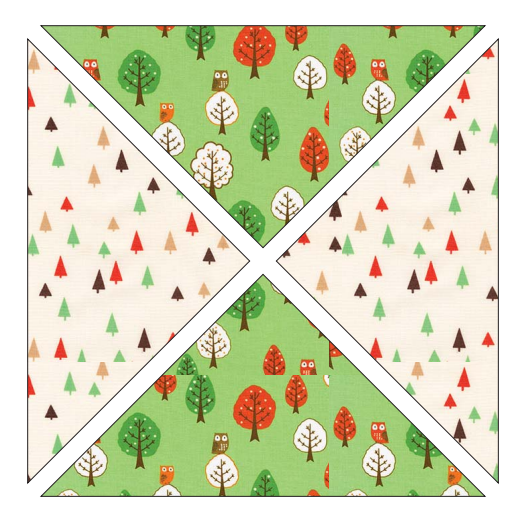
Step 1 : Arrange two Fabric B and two Fabric C triangles to form an hourglass block, taking care to orient the fabric as shown in the example here.