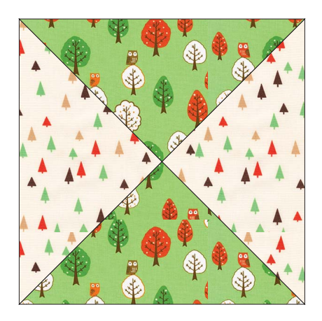
Step 3: Sew the triangles together along the longest edge, nesting the seams and pressing the seam open or to one side. Trim to 8-1/2" square.