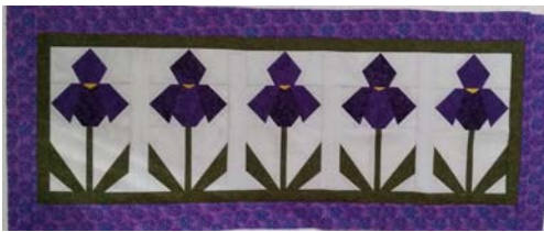
"Iris Garden Runner"