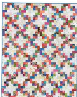
Three Patch Chain

Wednesday, March 6, 13, 20, 27 and April 3 1:00-4:00 OR 6:00-9:00 $60 Ann Pollinger