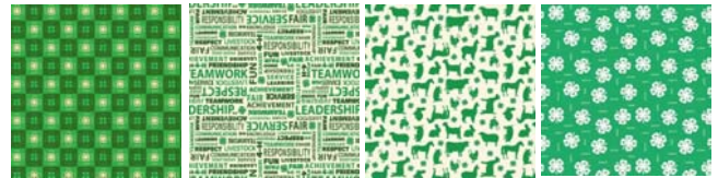
C9123-GREEN C9124-CREAM C9120-CREAM C9121-GREEN

Are you preparing for your County and State Fair projects? Look at the fabric that has recently arrived in our store! This fabric from Riley Blake Designs features animal silhouettes and the 4-H inspired emblem and traits in the standard 4-H color scheme.