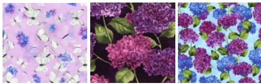
Y2822-44-LIGHT EGGPLANT Y2819-45-EGGPLANT Y2819-55-MULTI

Designed by Cedar West for Clothworks, this cotton blender fabric is perfect for quilting, apparel, and home decor accents. Fresh, fun and full of variety, their fabric speaks for itself. Clothworks showcases original artwork that delights and inspires sewers all over the world.