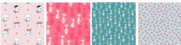
SC8910-PINK C8913-HOTPINK C8913-TEAL C8914-MINT