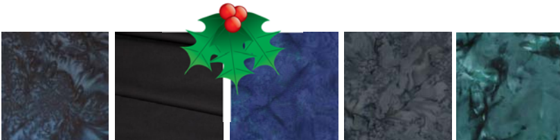
5020B 8008B 7022B 8006B 7251B

Our Batik fabric collection is second to none. We are thrilled to announce that we have added more Batik cotton blender fabrics to our Batik selection from Batik Textiles. These fabrics add a unique element to any design.