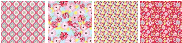
C881-BLUE C8880-BLUE C886-MULTI C8883-DKPINK

Thanksgiving is a time to reflect on all that we are thankful for. What are you most thankful for? I am very thankful for my faith, my family, my friends, and getting the opportunity to do something I love. At Something For You, we are very thankful for each and every one of our customers. We strive to provide the best service and products to our wonderful base of customers. Thank you for giving us the opportunity to be of service to you!