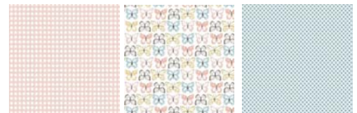
WW19080 WW19063 WW19079

"Wanderings" by Lori Woods for Poppie Cotton is a new line of fabric that has recently been added to our fabric selection. Stop by and take a look!