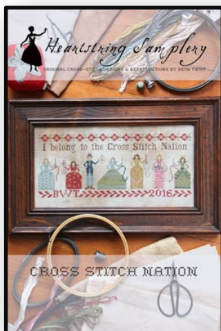
Cross Stitch Nation from Heartstring Samplers

Here's a sampling of some of the newest designs that are in stock and available now!