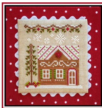
Country Cottage Ginger- bread House #7