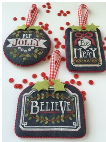
Chalkboard Ornaments Christmas Collection Part I

Here's a sampling of some of the newest designs that are in stock and available now!