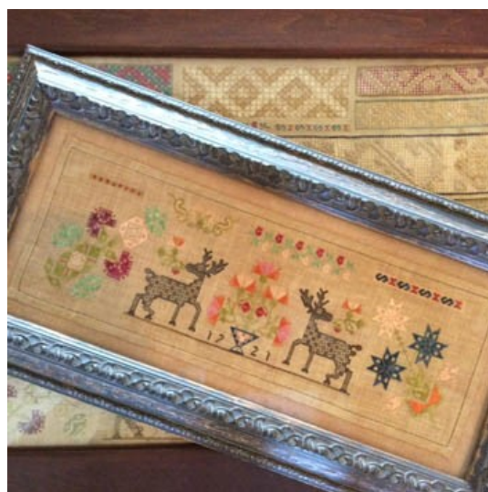
Samplers Remembered Checkerboard Stag Sampler