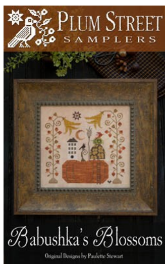
Babushka's Blossoms Plum Street Samplers