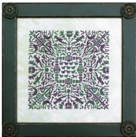
Ink Circles Reflections of Scotland (left) Reflections of London (right)