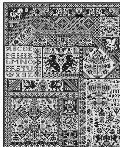
Above: Death By Crossstitch Long Dog Samplers