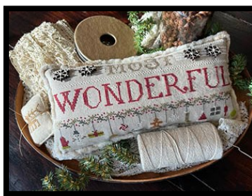
Far Left: Artsy Housewife: Study in Nature Left: Shakespeare's Peddler: Most Wonderful