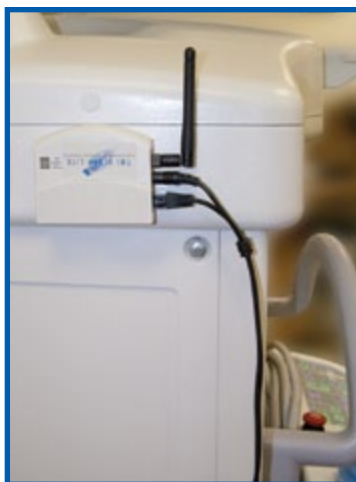
FLASH LITE shown mounted on OEC™ 9900