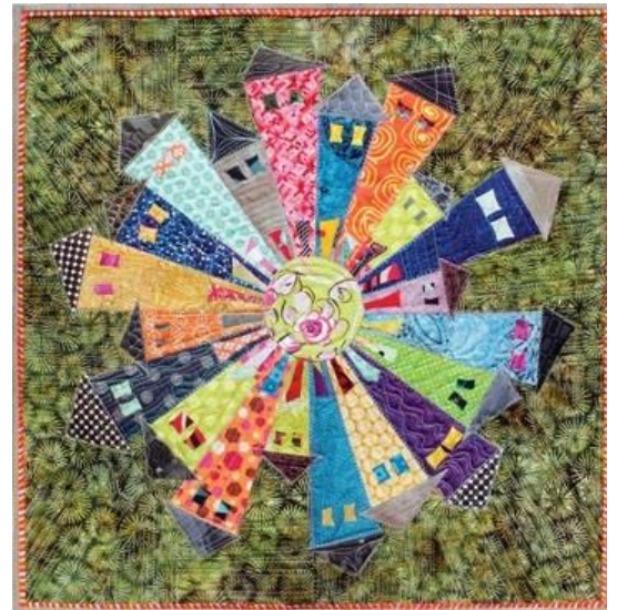
Dresden Neighborhood Mini Quilt with Joy (All Day Class) Quilt size: 24" X 24"