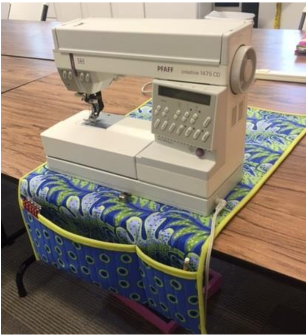
Sewing Machine Mat with Jennifer