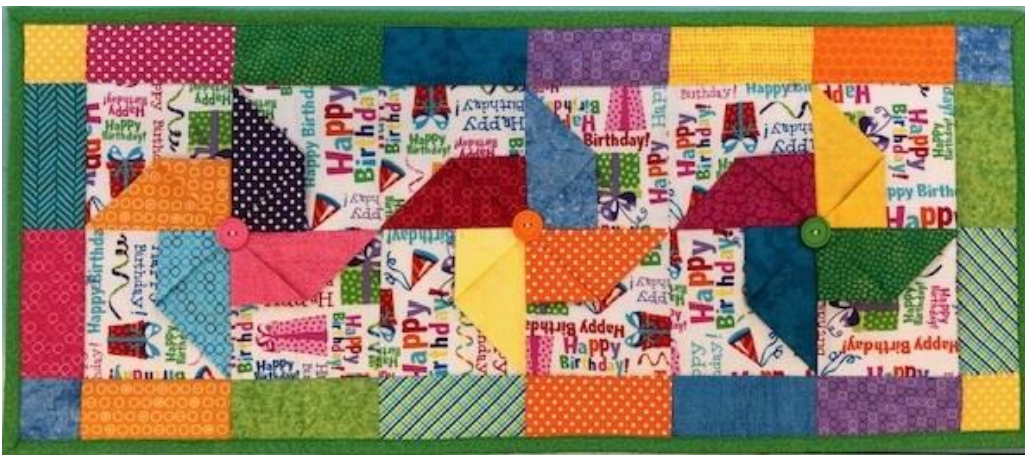
3D Pinwheel Table Runner with Cathy Size: 13" X 31"