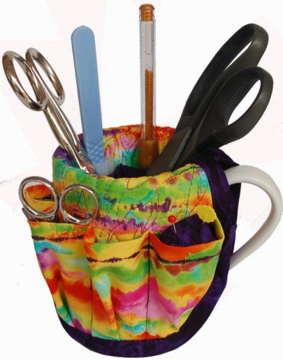
Sewing Utensil Cup with Jennifer