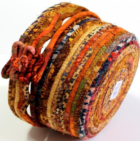
Coiled Rope Basket with Sally