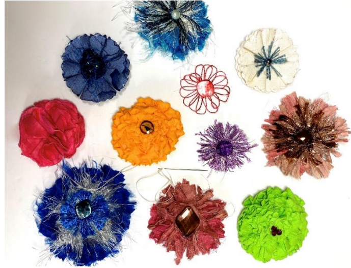
Embellishments with Sally