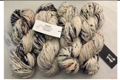
Sequoia Yarn by Baah HERE

Fantasy Naturale from Plymouth Yarns is a 100% mercerized cotton yarn that is machine washable. The wide color range makes Fantasy Naturale a perfect yarn for many projects.