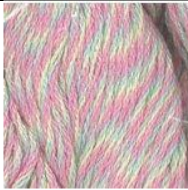
Fantasy Naturale Yarn by Plymouth HERE

A fabulous fun yarn for all your children's wear! Plymouth Yarn Jelli Beenz is a variegated yarn with pops of contrast color studded throughout - an easy-care yarn (essential for children!) and a quick knit on US 8 (5mm) needles or H (5.00mm) hook!