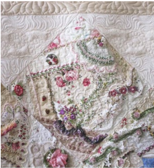
Quilting by Rita Meyerhoff

Materials Kit: $15, includes a pre-basted sampler with regions stitched out to practice quilting techniques or bring your own pre-basted 36" square sandwich if you're working on a domestic machine. If you are working on a Gammill, bring 40" squares of backing and batting, and 36" square of solid fabric for a quilt top. Students will use one of Jukebox Quilts 5 Gammill machines in hand guided, stitch regulated modes, or can use a Juki (first come, first served on our machines) or your own domestic machine. Questions? Contact Rita at rita@heavensquilts.com .