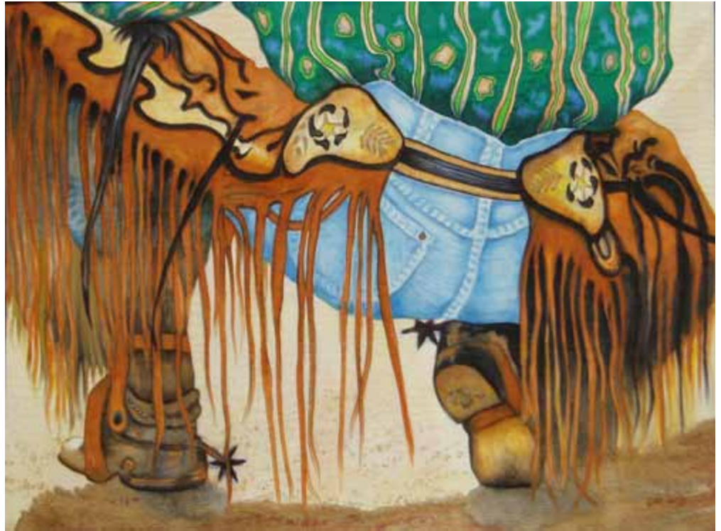
Earth Beneath our Feet by Patt Blair

This class is perfect for those that don't draw, don't paint, or don't usually quilt their own work but wish they could! Bring an enlarged photo tracing from one of your own photos or choose in class from one of my ready to go contour drawings. ( Go to www.pattsart.com and click on EZ drawing method for getting your own ideas ready) You'll paint using TSUKINEKO fabric Inks and special stick applicators for over half this class. (See Patt's Ready To Go 18 x 24" Options.. viewable at www.pattsart.com via the button titled Workshops/ Supply List... shown at near top of page) Then we'll move forward with what's next. What kind of bordering or quilting lines/ thread choices will make your painted piece sing? For those that wish, you may bring your machine and apply your quilt plan created in class. For those that prefer to continue painting, it's perfectly fine. All levels welcome. Click here to register.