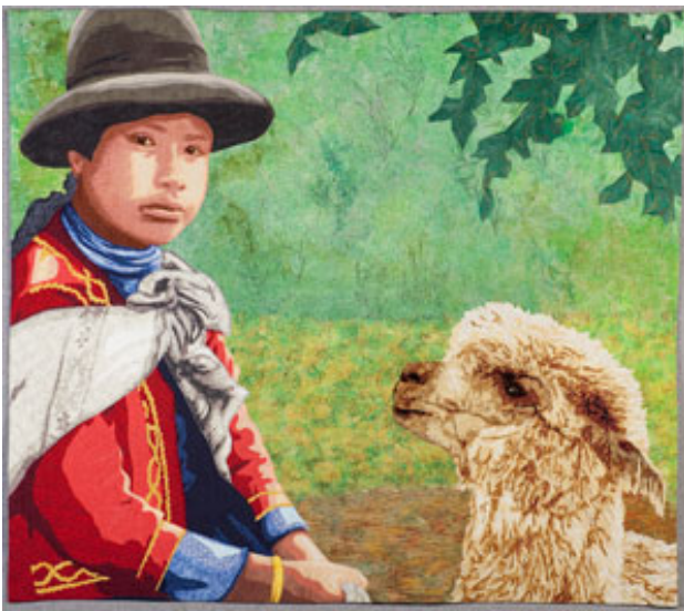
Peruvian Girl with Llama