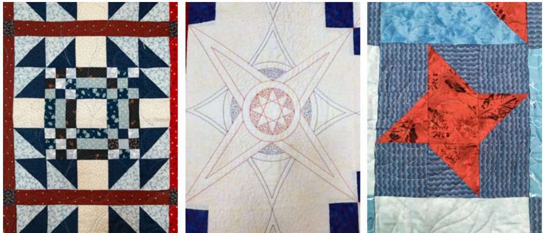
Close-ups of a few of the quilts on display