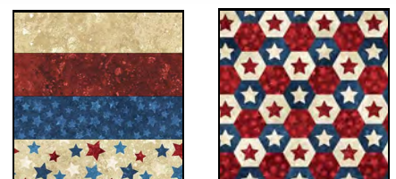
Fig. 1—Blocks version 1