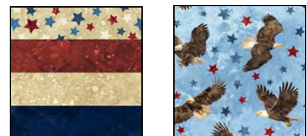
Fig. 2—Blocks version 2