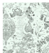
Backing 44" (111.76cm)

Sketchyer Paper QBTP005.PAPER 2 1/2 yards (1.94m)