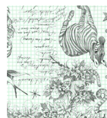
Backing 108" (274.32cm)