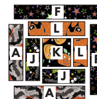
Block 2 (Make 4)