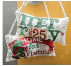
Christmas Door Decor