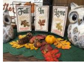
Fall in Love Table Topper