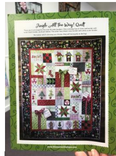
Jingle All the Way 1 of 3