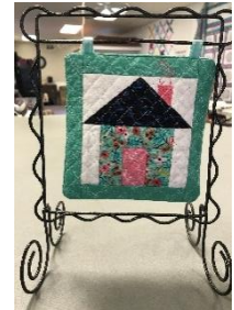
Embroidery Club Love of House