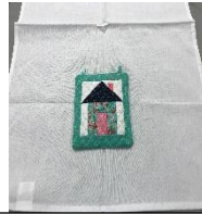
Tea Towel Love of House