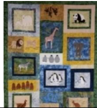
A Day at the Zoo